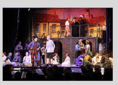
Our Performing Arts Faculty would like to say a huge thank you to everyone, both in the school and wider community, who helped make the show such a success. Take a look at the school website for more great photographs.

After 8 months of planning and rehearsals. October saw the Castlemilk High production of Lionel Bart's timeless classic 'Oliver!'take to the stage. Running for four nights and performed by two dedicated casts, audicences were treated to some stunningly produced songs, dances and acting. With favourites such as 'Consider Yourself' and 'Pick a Pocket or Two' lighting up the stage and getting toes tapping the pupils, staff and volunteers put on a show to remember.